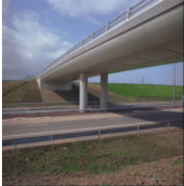
Severn Crossing Approach