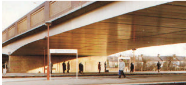
Bromley South Bridge

Bromley South Bridge is the major element of a road built to remove traffic from the town centre. It passes between residential and business areas, and includes a crossing over the main line railway. The plate girders of the main spans of the bridge are enclosed in a GRP membrane enclosure, in order to provide access for inspection and maintenance and to enhance the appearance of this section of the bridge. The 'caretaker' system was used with Maunsell Structural Plastics ACCS components (see Bridges application sheet). Great importance has been given to the appearance of the scheme. The bridge parapets, pier and abutments are clad in intricately patterned brickwork, with panels manufactured from GRP to simulate brickwork.