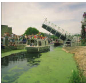
Bonds Mill Lift Bridge with ACCS deck

Construction is usually pultruded glass fibre reinforced polyester or vinylester, although some types are hand-laminated. Decks are prefabricated and craned onto bearings as a single unit leading to considerable savings in installation time. Principal advantages are durability and lightness. The biggest deck spans are up to 10m. Variants capable of 40 tonne loads are available. Wear