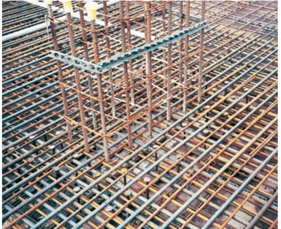
Figure 1: Loose bars laid around starter bars for column, where shear heads are in position.

Novel approaches to reinforcement supply and rationalisation can help optimize flat slab construction.